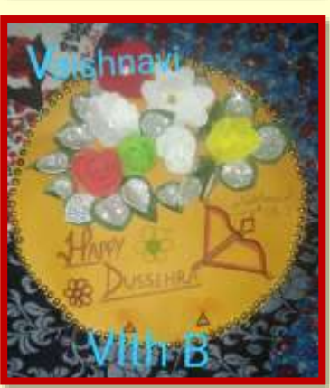
Dussehra symbolizes the triumph of good over evil. Students enjoyed all the activities with lot of enthusiasm.

DAV Bazpur is being re-opened for offline classes on 2<sup>nd</sup> November for Classes X and XII as per the instructions of the Government of Uttarakhand & local administration. Instructions have been given to students to follow in the school. Parents have been requested to submit their consent for sending their wards to school.